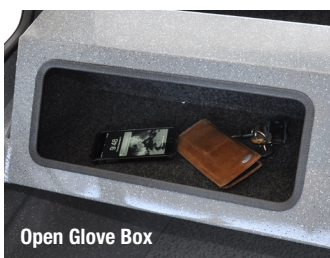
Open Glove Box