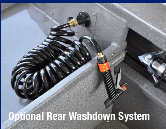
Optional Rear Washdown System