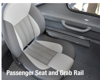
Passenger Seat and Grab Rail