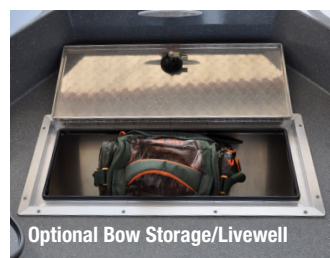
Optional Bow Storage/Livewell