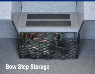
Bow Step Storage