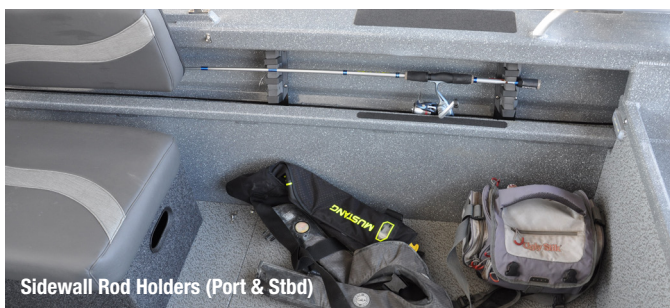
Sidewall Rod Holders (Port & Stbd)