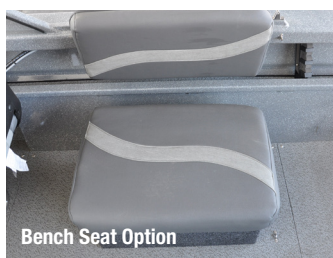
Bench Seat Option