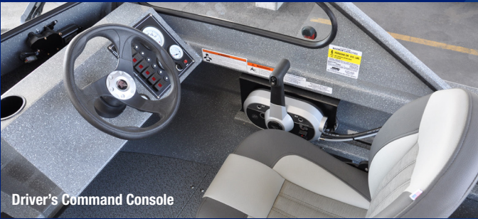
Driver's Command Console

Built for the serious sportsman, the Areus is ruggedly constructed to handle all your fishing adventures. Fully-loaded, you'll experience a comfortable, safe ride.