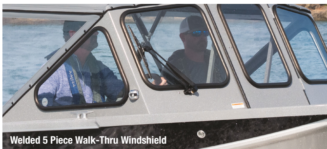
Welded 5 Piece Walk-Thru Windshield