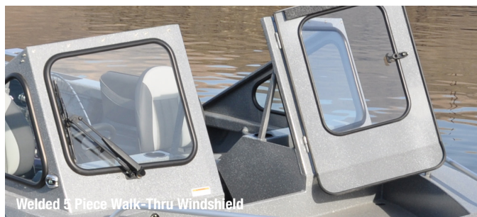
Welded 5 Piece Walk-Thru Windshield