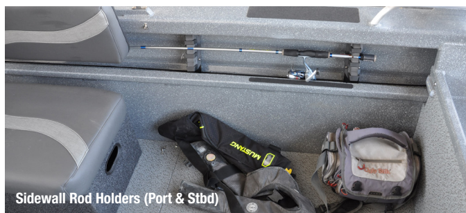
Sidewall Rod Holders (Port & Stbd)