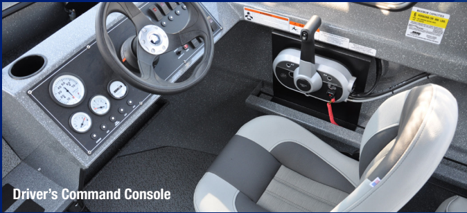
Driver's Command Console

Built for big water, the Astoria is wide, deep and ruggedly constructed to handle all your fishing adventures. Comfort and safety are combined for the serious fisherman.