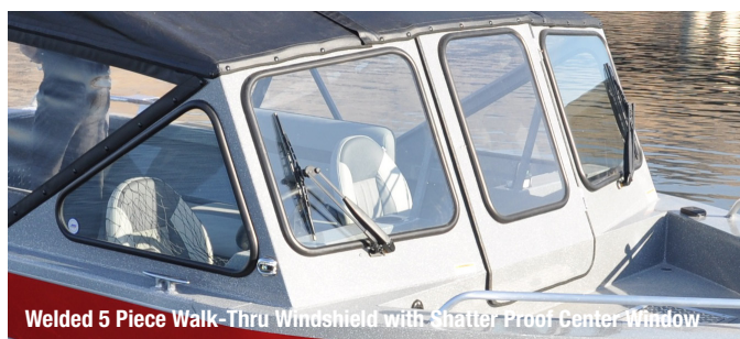
Welded 5 Piece Walk-Thru Windshield with Shatter Proof Center Window