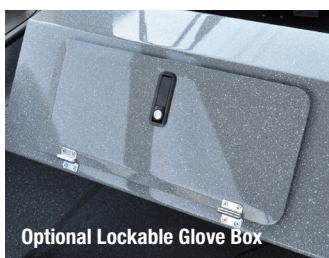
Optional Lockable Glove Box