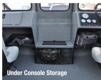
Under Console Storage