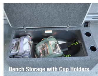
Bench Storage with Cup Holders