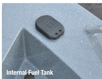
Internal Fuel Tank