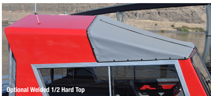
Optional Welded 1/2 Hard Top