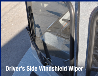
Driver's Side Windshield Wiper