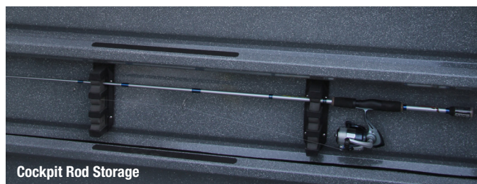
Cockpit Rod Storage