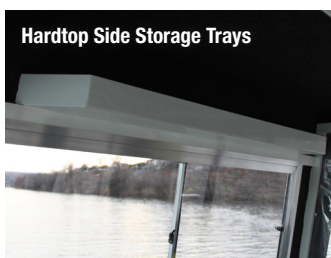
Hardtop Side Storage Trays