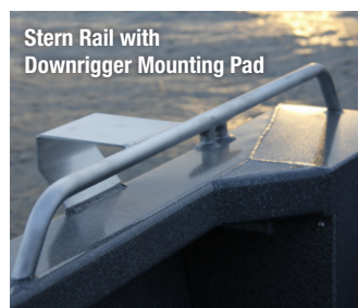
Stern Rail with Downrigger Mounting Pad