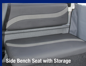
Side Bench Seat with Storage