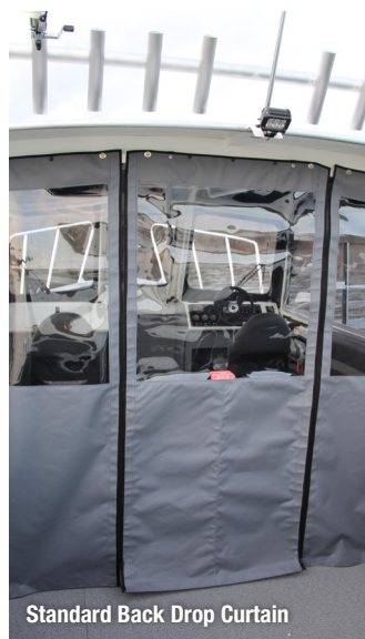
Standard Back Drop Curtain