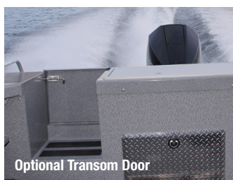
Optional Transom Door