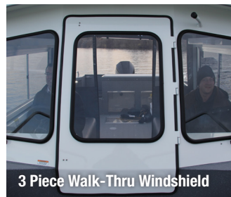
3 Piece Walk-Thru Windshield