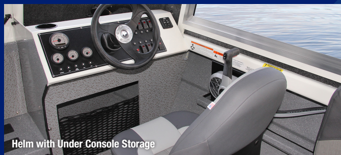
Helm with Under Console Storage

Built for big water, the Maximus is wide, deep and ruggedly constructed to handle all your fishing adventures. Comfort and safety are combined for the serious fisherman.