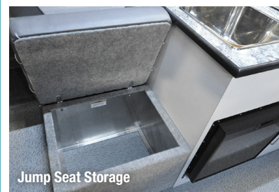
Jump Seat Storage